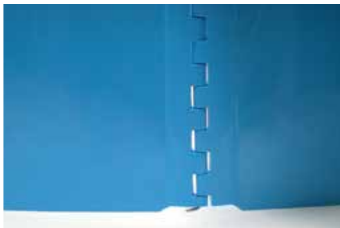
Hinge Lace Welded to Belt

Ensure that the conveyor pulleys fully support at least 80% of the surface when using lace. Hinge Lace is only compatible with Volta 'M' and 'L' Family Flat Belts and with belts of a thickness between 3mm and 5 mm inclusive.